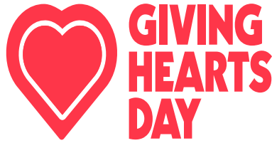
Don't stretch or condense