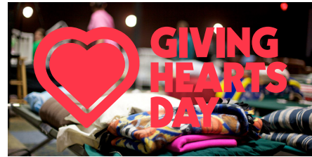
Don't place colored on busy backdrop