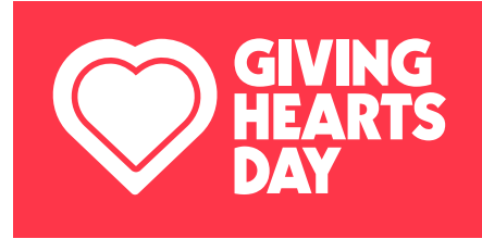
Do use reverse