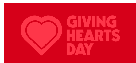
Do use over similar color that impedes legibility