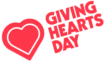
Do rotate proportionally

The logo should never be altered, distorted, manipulated, or disassembled in any application.