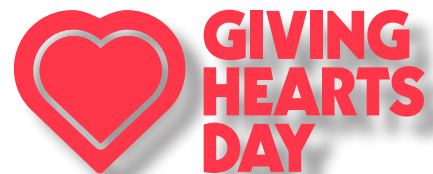
Don't use special effects like drop shadows